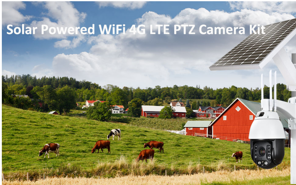
6 Inch 5MP 20X 60W Solar Powered WiFi 4G LTE PTZ Camera Kit

LOYALTY-SECU 6inch 5MP LTE Network PTZ Camera utilizes 4G-LTE connectivity. It is ideal to install it where there is no WiFi signal. Meanwhile, it adopts the high accuracy stepping motor, works with the high performance motor driver, which ensures the PTZ IP camera works under a stable, accurate, and less vibration condition.