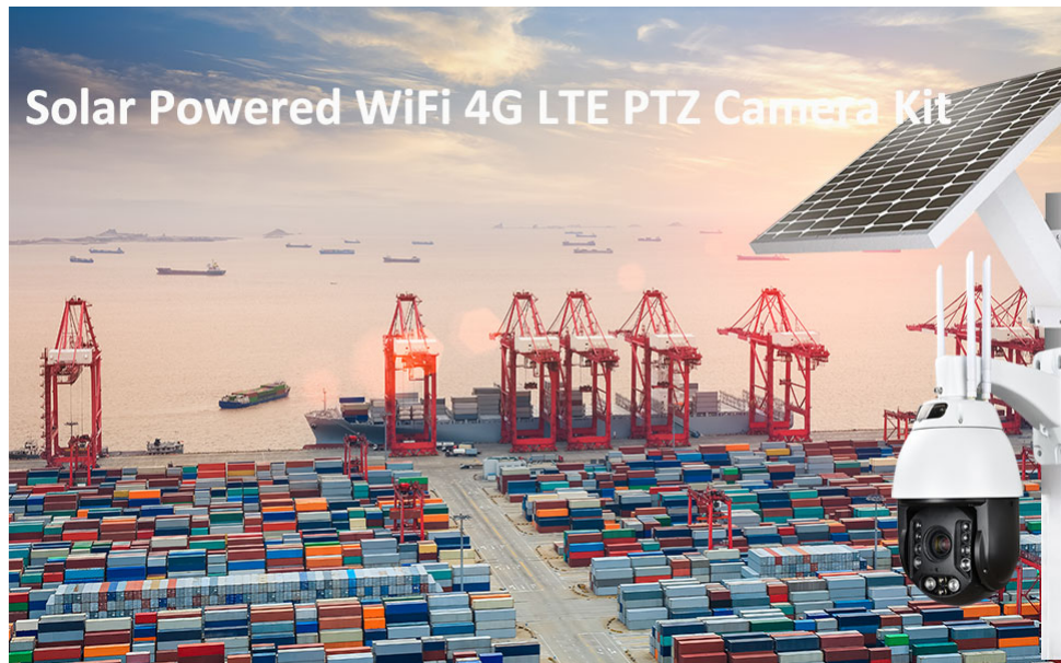
6 Inch 120W/40AH Solar Powered 1080P 22X 4G cellular Security Network PTZ Cameras

LOYALTY-SECU 6inch 2MP LTE Network PTZ Camera utilizes 4G-LTE connectivity. It is ideal to install it where there is no WiFi signal. Meanwhile, it adopts the high accuracy stepping motor, works with the high performance motor driver, which ensures the PTZ IP camera works under a stable, accurate, and less vibration condition.