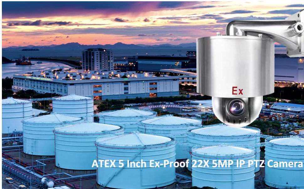
ATEX 5 Inch 5MP Ex-Proof High Speed Dome 22X PTZ Camera

The explosion-proof PTZ cameras have been certified and designed to meet strict standards regarding installation in potentially explosive environments, given the presence of gas and flammable dust. The wide range ensures excellent performance for monitoring critical processes and it is the perfect video surveillance solutions for chemical, oil and gas industries. Their sturdiness and zero maintenance make these products suitable for use in extreme environmental conditions and offer a level of quality beyond any expectations.