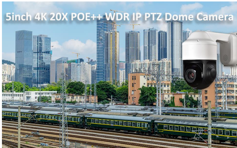
5inch 8MP 20X IR POE++ PTZ IP Dome Camera Outdoor

The High Speed PTZ Camera adopts the advanced anjvision solution, it's not only bringing ultra-HD video streams, but also delivers reliable operation, a long & stable operating life, and a wonderful using experience.