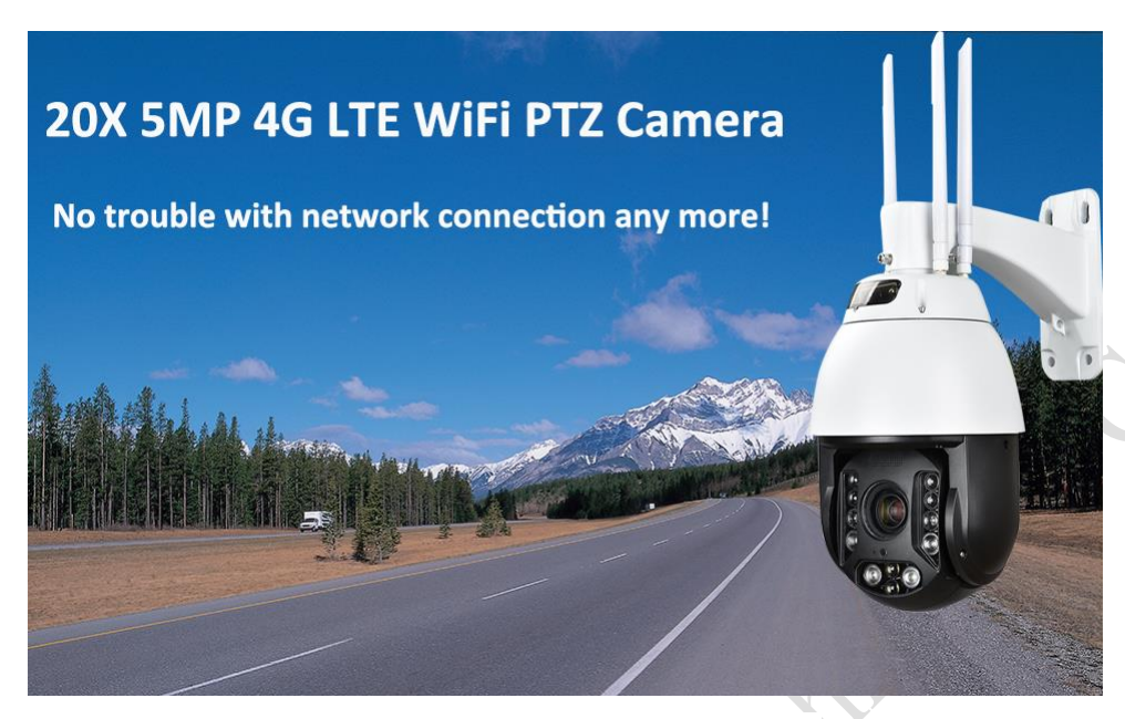
6 Inch 5MP 20X Auto-tracking WiFi 4G cellular IP PTZ Cameras

4G LTE wireless security camera systems are ideal when there is no option for a point-to-point wireless system or hardwired broadband connection, but cell service is available. If you have cell phone service at your project location, you will most likely be able to use 4G LTE cellular communications to access your video system. Our high gain 4G antenna systems maximize signal strength.