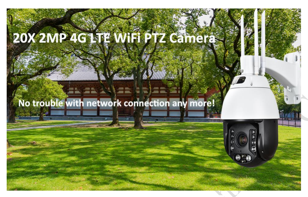
6 Inch 2MP 20X Auto-tracking WiFi 4G cellular IP PTZ Cameras

LOYALTY-SECU 6inch 2MP LTE Network PTZ Camera utilizes 4G-LTE connectivity, it is ideal to install it where there is no WiFi signal. Meanwhile, it adopts the high accuracy stepping motor, work with the high performance motor driver, which ensures the PTZ IP camera work under a stable, accurate, and less vibration condition.