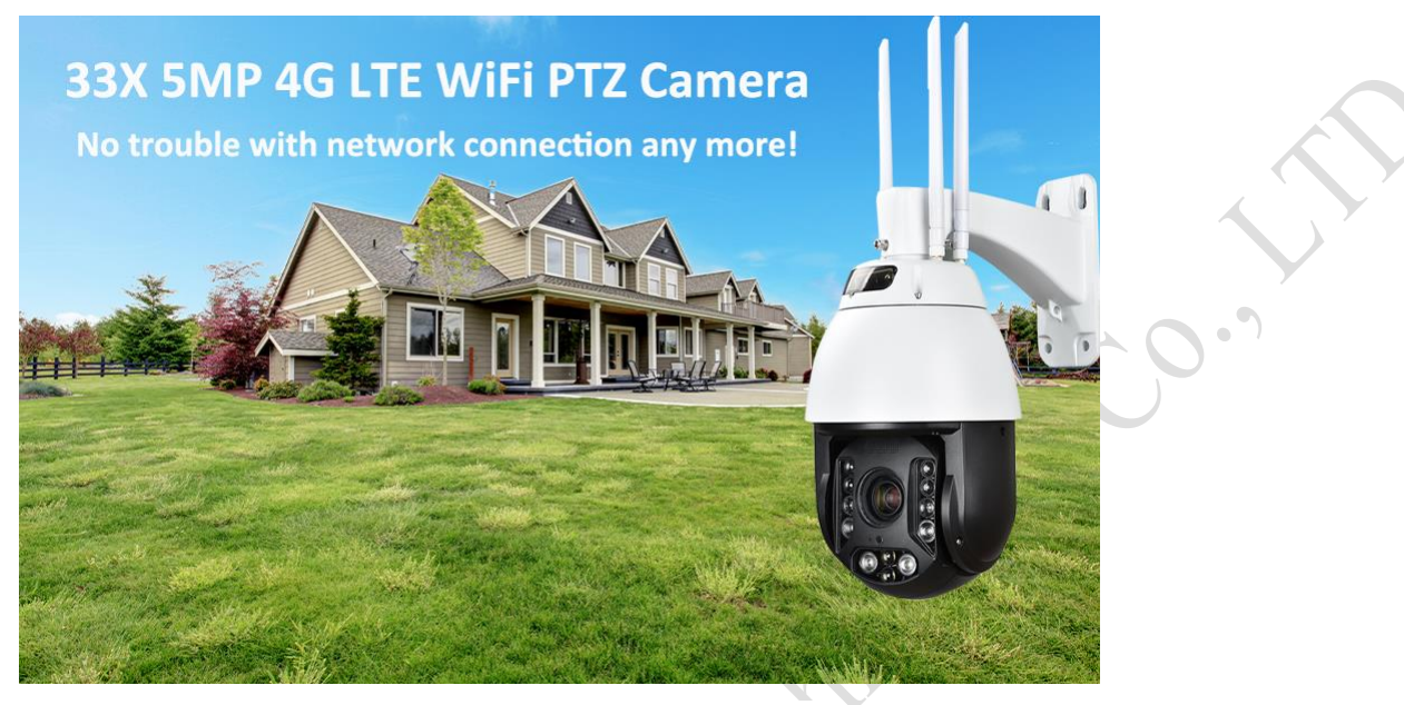
6 Inch 5MP 33X WiFi 4G cellular Security Network PTZ Cameras

LOYALTY-SECU 4G LTE wireless security PTZ camera systems are ideal when there is no option for a point-to-point wireless system or hardwired broadband connection, but cell service is available. If you have cell phone service at your project location, you will most likely be able to use 4G LTE cellular communications to access your video system. Our high gain 4G antenna systems maximize signal strength.