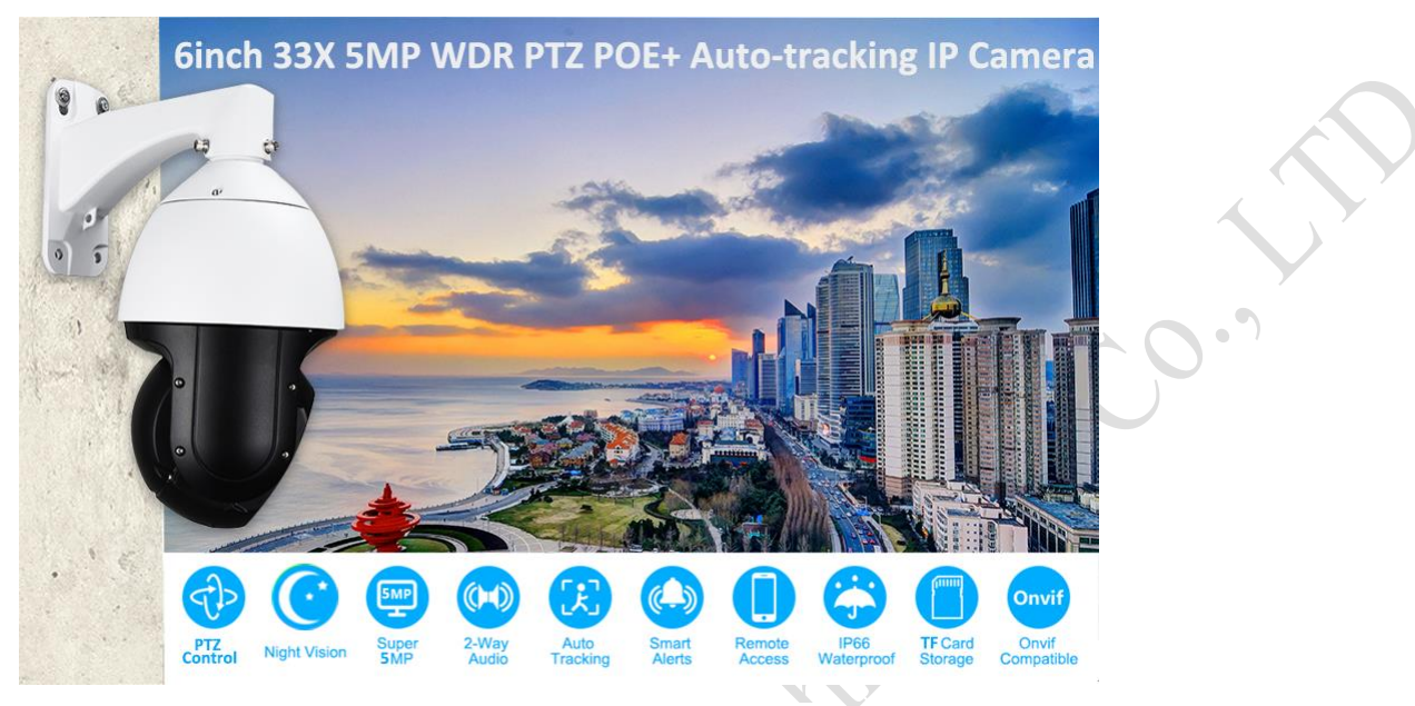
6inch 5MP 33X IR Auto-tracking PTZ IP Dome Camera Outdoor

The High Speed PTZ Camera adopts the advanced Uniview solution, it's not only bringing the rich AI Functions, such as Face Detection, Auto-Tracking for long-distance video surveillance, Multi-behavior Detection, but also delivers great video quality, reliable operation, a long & stable operating life, and a wonderful using experience.