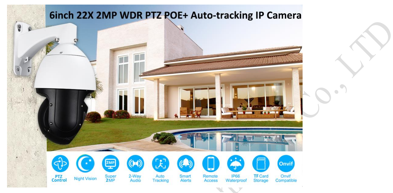
6inch 2MP 22X IR Auto-tracking PTZ IP Dome Camera Outdoor

The High Speed PTZ Camera adopts the advanced Uniview solution, it's not only bringing the rich AI Functions, such as Face Detection, Auto-Tracking for long-distance video surveillance, Multi-behavior Detection, but also delivers great video quality, reliable operation, a long & stable operating life, and a wonderful using experience.